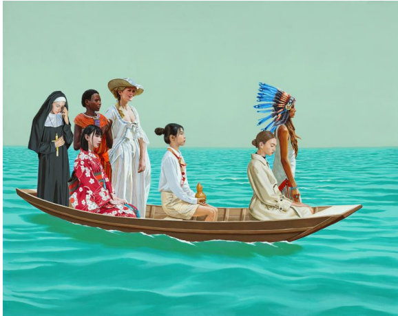
Tamen, Wonder women, 120x150cm, 2020

We yet have to discover the new order and logic of things. Artists, however, with their heightened sensitivity are more prone to attune and reflect on the subtleties of alternative dimensions that surround them. The work you will see in